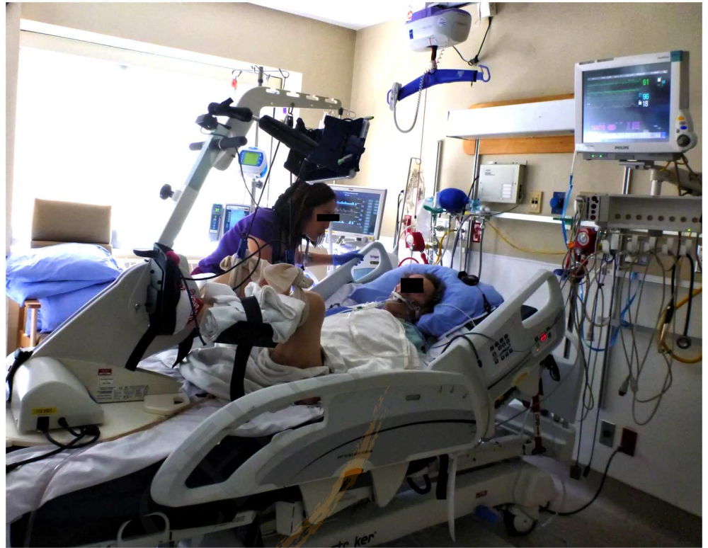
Fig 1. Example of in-bed cycling. This figure demonstrates a patient in the ICU receiving in-bed cycling and mechanical ventilation. An ICU physiotherapist supervises the in-bed cycling session.